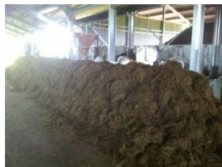
Figure 2: Traditional Compost at the start.