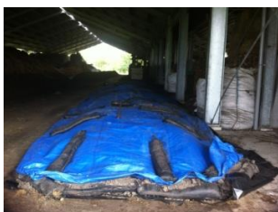
Figure 1: Bokashi at the start.

Figure 1 shows a picture of the Bokashi windrow at the start of the experiment. The windrow with Traditional Compost at the start of the experiment is shown in figure 2. The rows were located inside, so rain could not dilute the compost windrow. Leakage of surplus moist with soluble components was possible for both windrows.