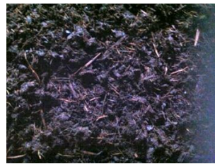
Figure 4: Bokashi after 6 weeks of fermentation Figure 5: Compost after 6 weeks of composting

Besides, in traditional Compost, seeds are eliminated due to the high temperatures. With the Bokashi material, first experience was that there were no seeds surviving the process, despite the low temperature. It was expected that seeds might germinate, but then didn't survive due to a lack of light. This is, however, an issue that also needs to be further investigated.